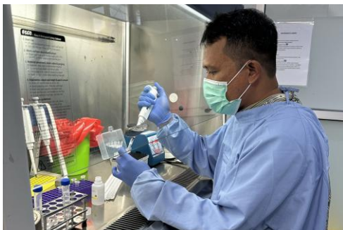
Taking on the challenge of basic research for the first time