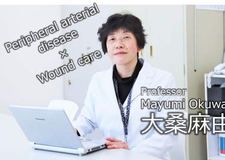
Professor Mayumi Okuwa 大桑麻由美

I am currently investigating the effectiveness of vibration massage in promoting peripheral circulation and preventing wound development in patients at high risk for peripheral arterial disease.