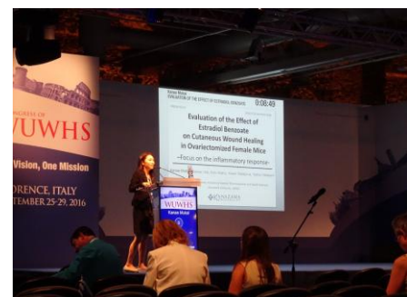
Research presentation at international conference (Italy)!