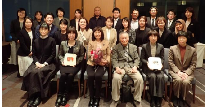
Alumni reunion in 2025