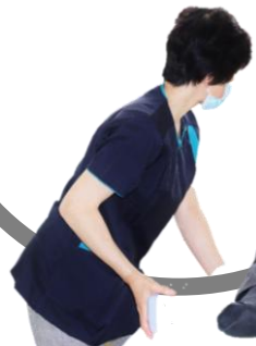
Clinical Research (Prof. Okuwa)

Implementation research (internationalization)