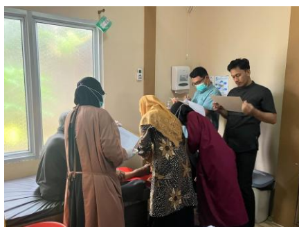
Under investigation at the wound clinic