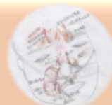
Qualitative sketching for pressure ulcer