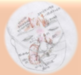
Qualitative sketching for pressure ulcer