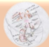
Qualitative sketching for pressure ulcer